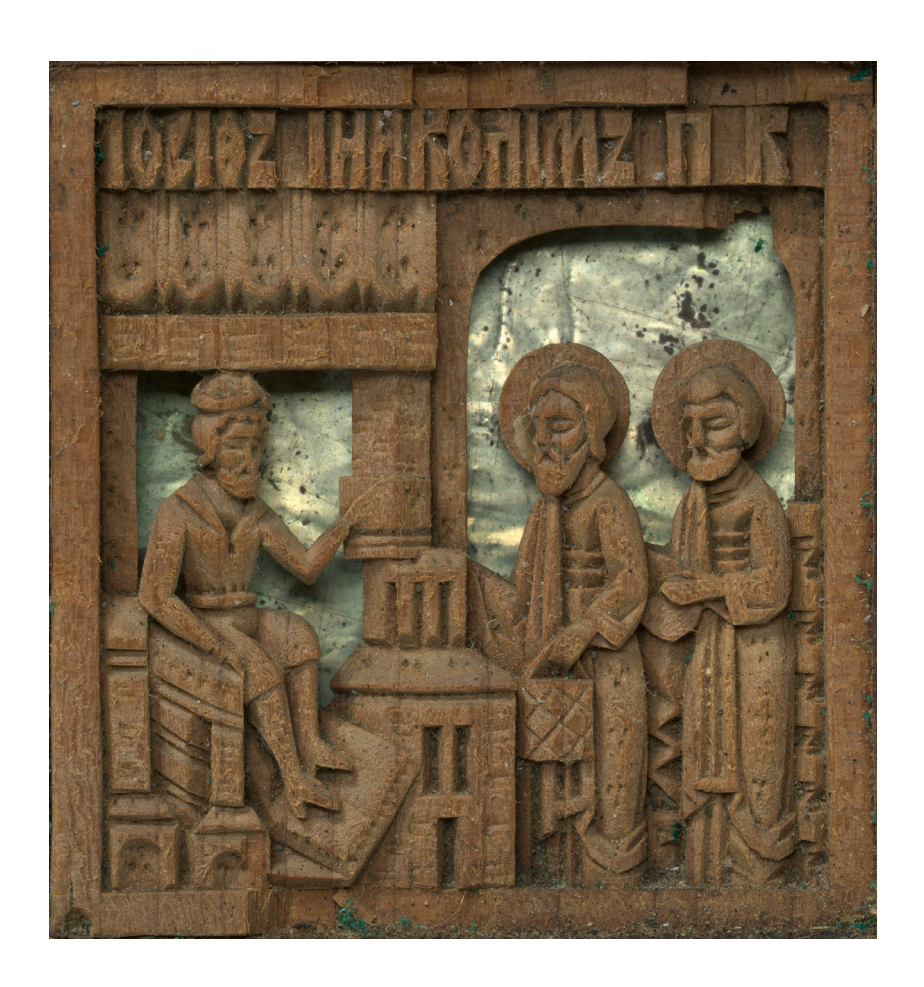
Fig. 7 Visit of Joseph of Arimathea and Nicodemus to Pontius Pilate, detail of Triptych (fig. 1).

The Rijksmuseum has a rare triptych in its collection, which was probably used for private devotion at home and while travelling. The discovery of a younger brother in St Petersburg raises the question of whether more related triptychs exist. Research into those examples may yield information on how these triptychs were made, for whom and what their place is in Russian Orthodox art.