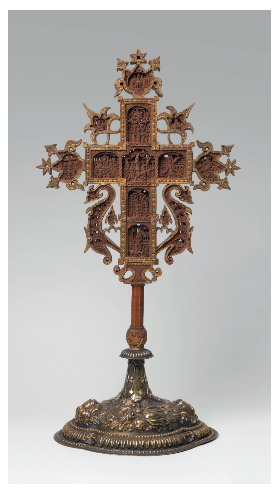
Fig. 2 Wooden Cross, Athos, seventeenth century. Boxwood and metal, h. 49.5 cm. London, Courtauld Institute, inv. no. 0.1966.GP.269.